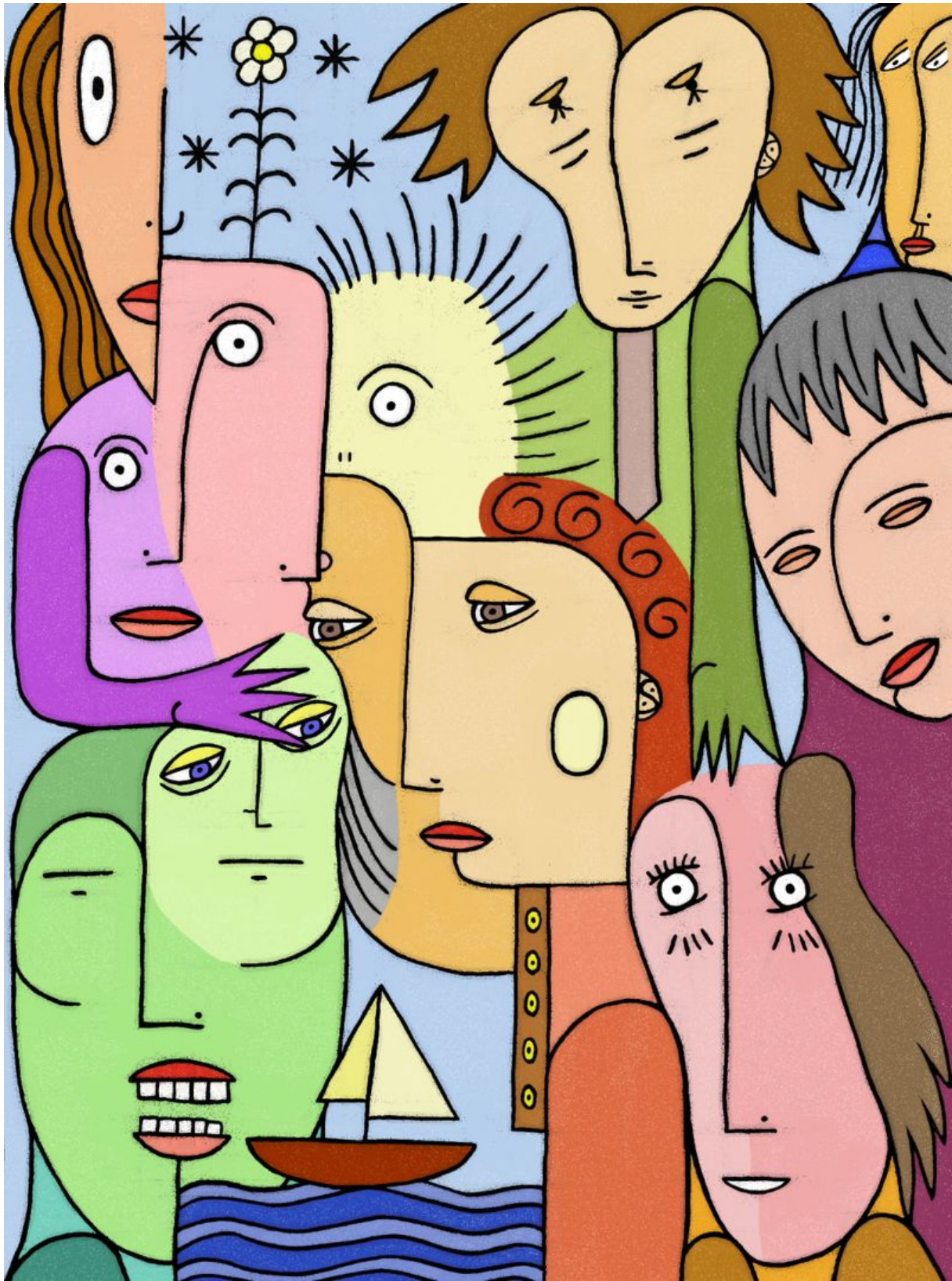
Faces, Flower and Boat (2024)