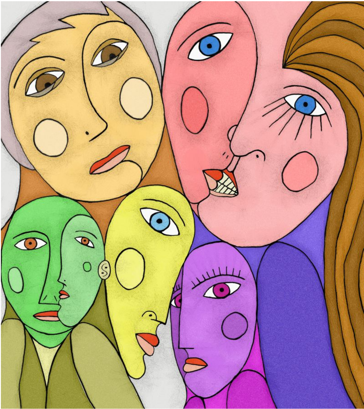
Tangent Faces (2024)