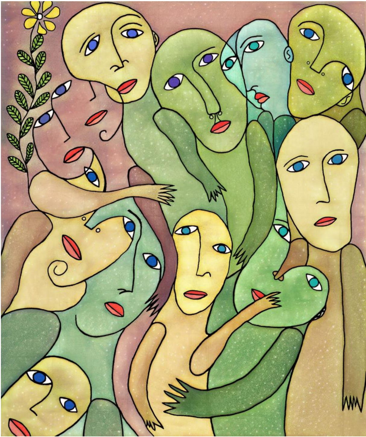
Tangled Characters (2025)