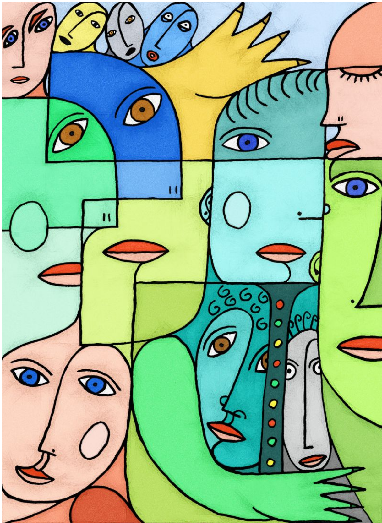
Face and Interwoven Lines (2025)