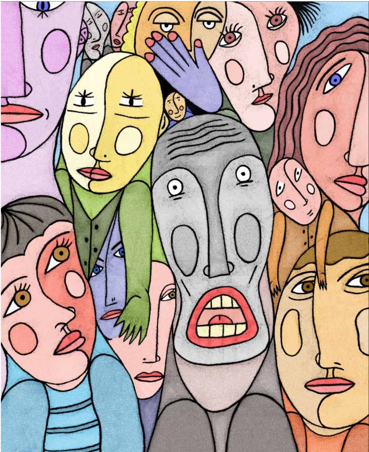
Group of Characters (2024)